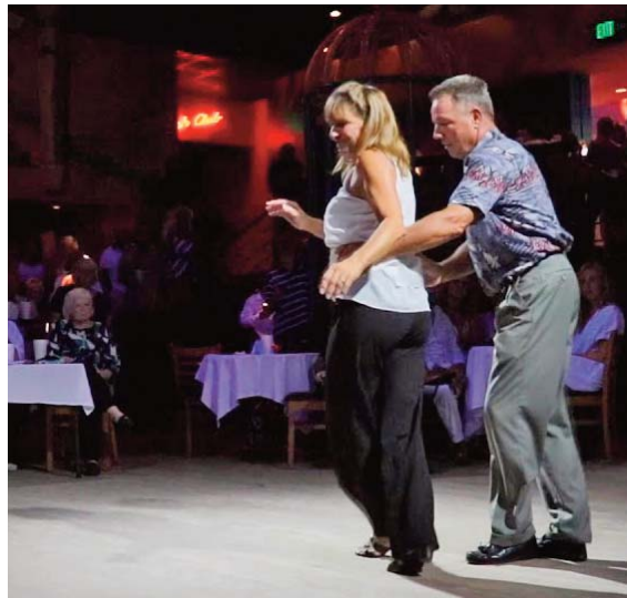
The Barbers will be guest instructors at the 2019 Capital Classic.