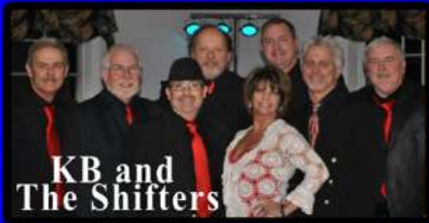
KB and The Shifters