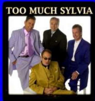
TOO MUCH SYLVIA