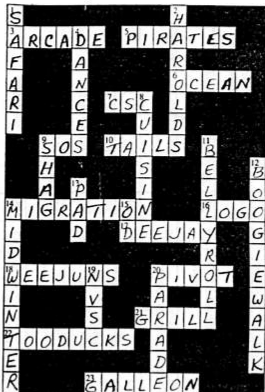
Shagger's Crossword Puzzle

Mail to: SOS, POB 4688, Columbia, SC 29204